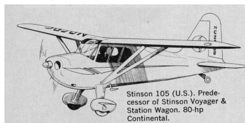
Stinson 105 (U.S.). Prede- cessor of Stinson Voyager & Station Wagon. 80-hp Continental.