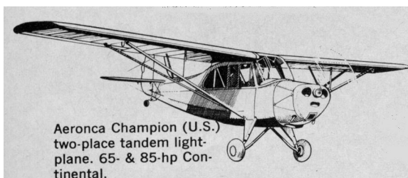
Aeronca Champion (U.S.) two-place tandem light- plane. 65- & 85-hp Con- tinental.