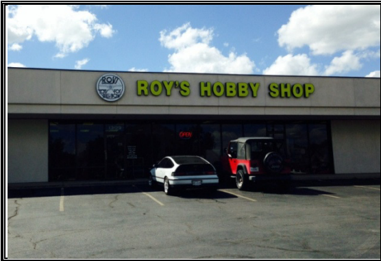
Roy's Hobby Shop 817 268-0210 1309 Norwood Dr. Hurst TX 76053 www.royshobby.com