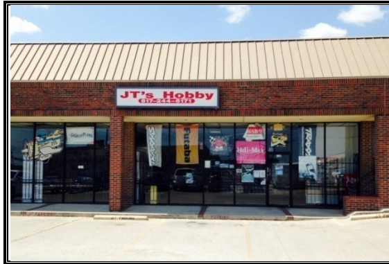
JT's Hobby Shop 817 244-6171 8808 Camp Bowie Blvd. Fort Worth TX 76116 jtshobby@yahoo.com