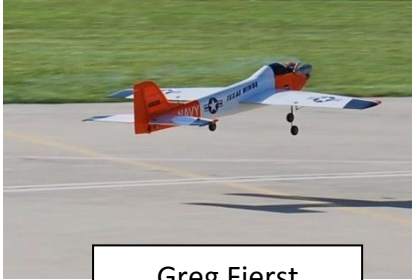
Greg Fierst smooth takeoff