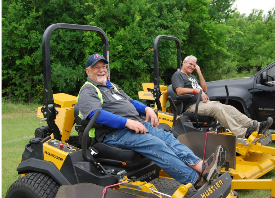
SAE CRASH RECOVERY – RAPID RESPONSE CREW