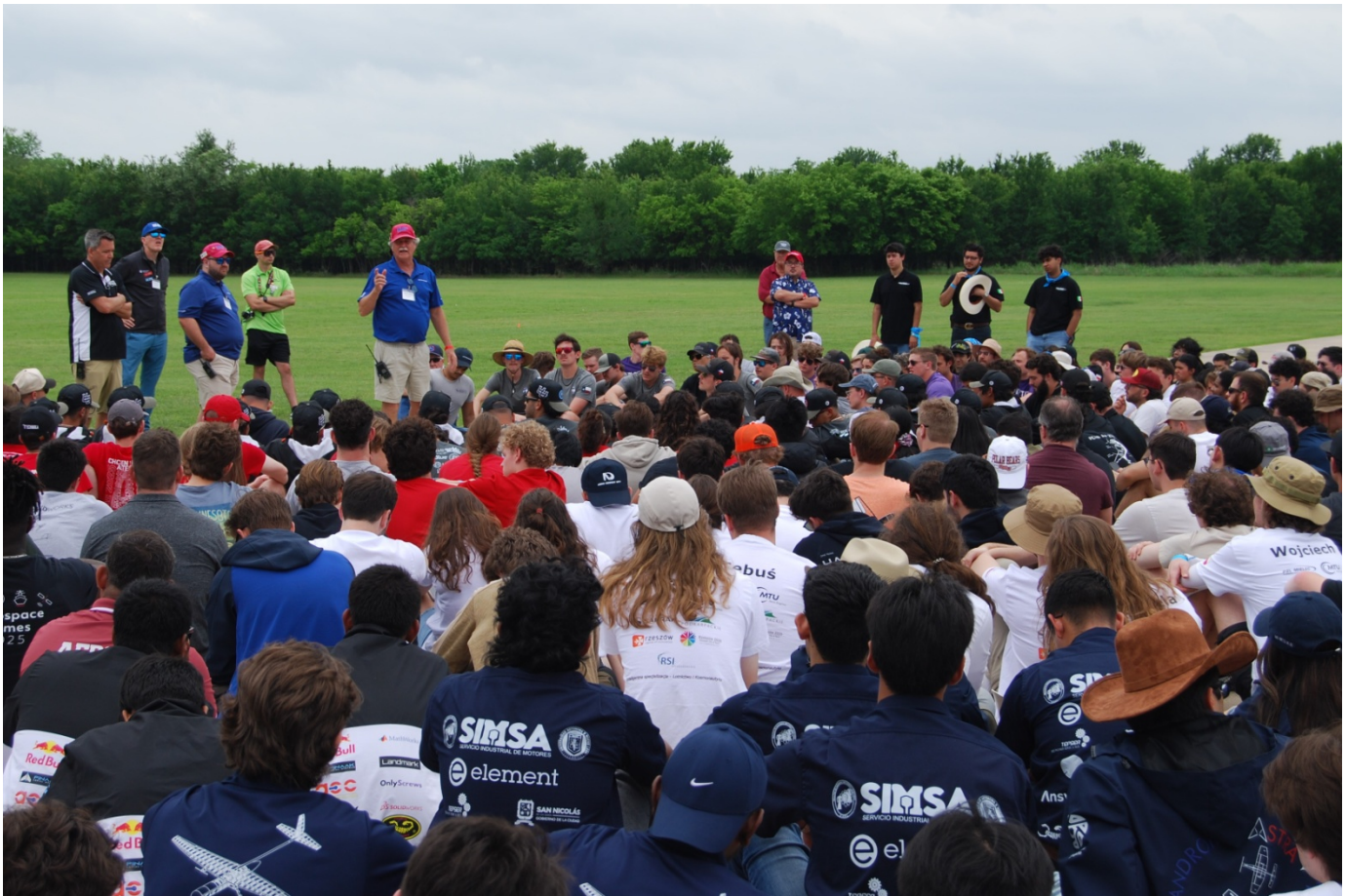
We're going to need a 'Bigger Boat'